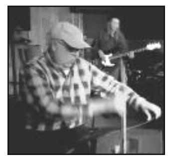
Local Musicians came out in September in Denton and November in Fort Worth for Local 72-147's new series of Meet and Greets + Jam Sessions throughout the Dallas/Fort Worth area. There are more to come. Stay tuned!