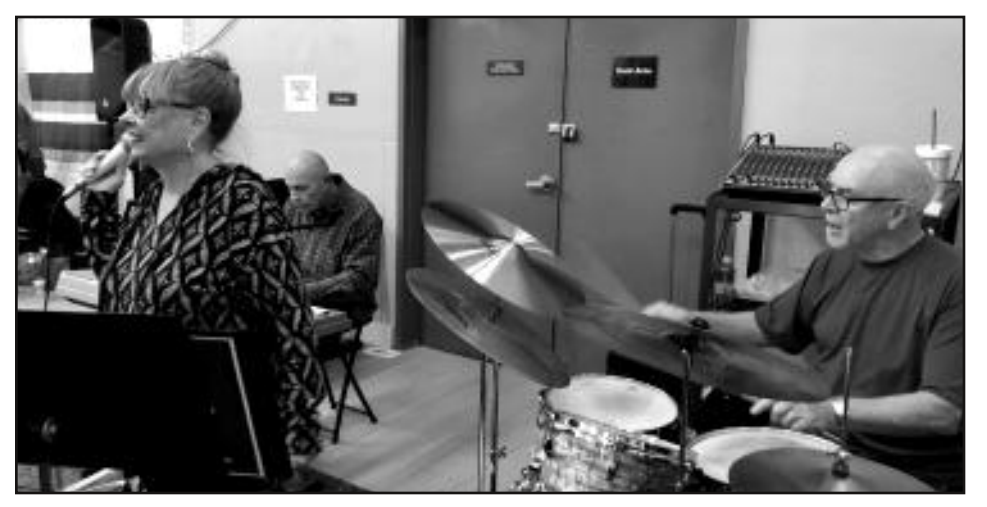
Last night at our monthly concert a gentleman came up and said, "This music is so great, it makes me feel like I'm not homeless!

On December 20 local musicians will be presenting an annual concert for people in our cities who experience homelessness. In addition to presenting musical entertainment they are raising funds to prepare Christmas packages for those in attendance. All money will go to purchase things they need such as, socks, scarves, gloves and hats. We would also like to include a treat or two like candy and cookies.